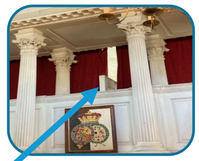
The Newcastle Pew Note the dividing screen