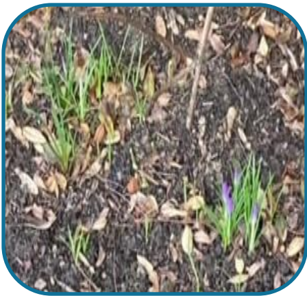
Crocus are starting to flower