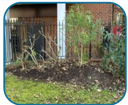
A bit of hard pruning!!!