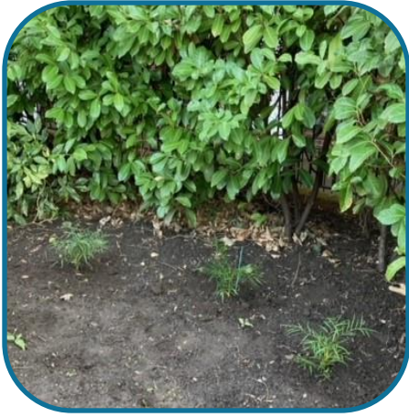
Three new plants planted.