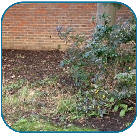
Hopefully our wild flower area