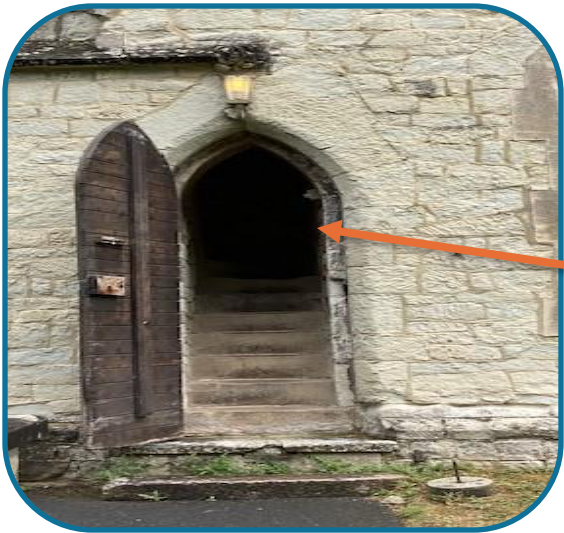
The bellringers were practicing during our visit.