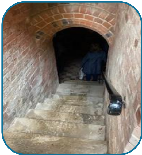
The steps into the Lovelace Mausoleum and the inside which has been restored by English Heritage