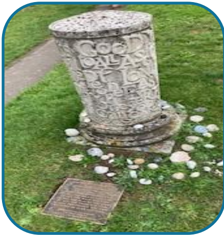
Top left: The Millenium Memorial