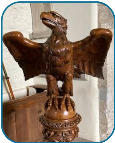
Bottom left: The beautifully carved wooden lectern

After our visit some of us wandered in to The Dabbling Duck for coffee, cakes, and chat.