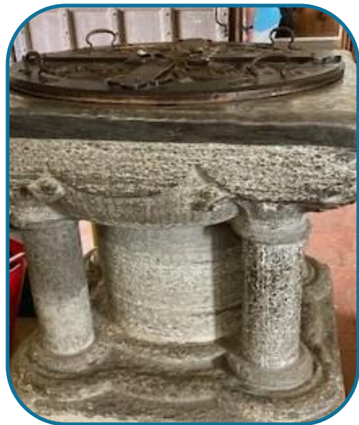
Top right: 12c Purbeck Marble font